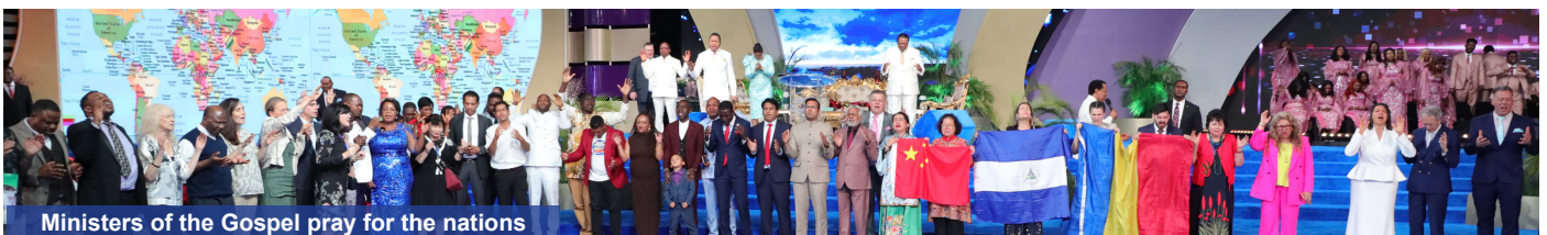
Ministers of the Gospel pray for the nations