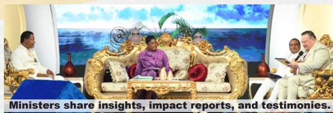
Ministers share insights, impact reports, and testimonies.