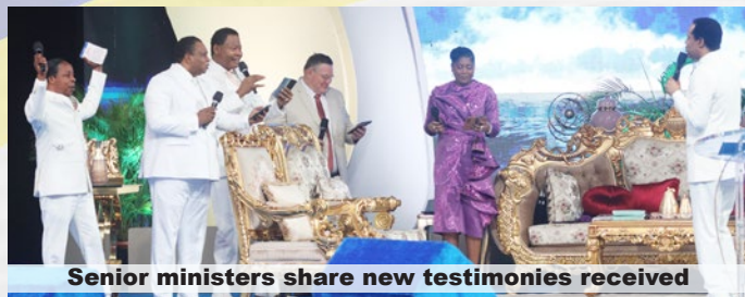
Senior ministers share new testimonies received

Spinal injuries, cancers, and myriad afflictions were healed instantly. Hospital wards were emptied, and wheelchairs and stretchers were permanently vacated as the healing streams of God flowed everywhere. Great rejoicing filled the nations and a ceaseless inflow of testimonies began.