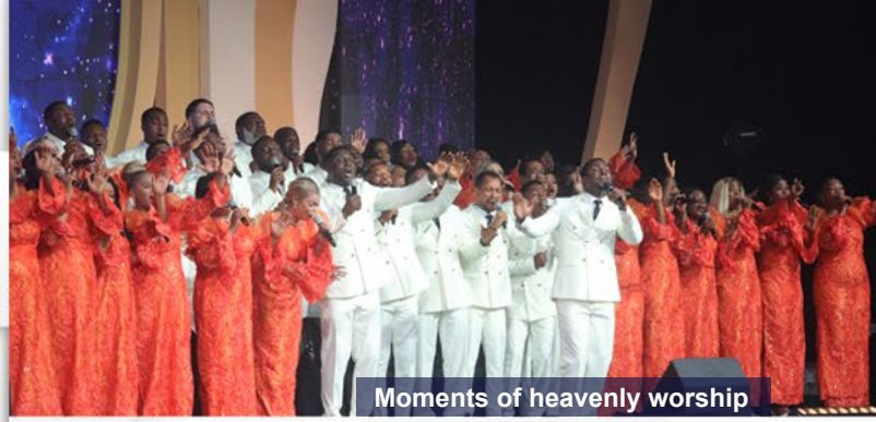
Moments of heavenly worship